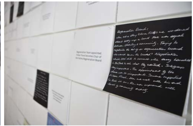
above: Fatima, A Cultural Archaeology , Timeline Wall NCAD Gallery, 2009.