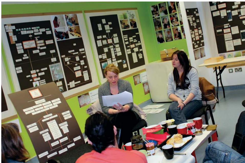
Arcade 2 Revision and Refinement, Rialto Youth Project room F2, 2013.