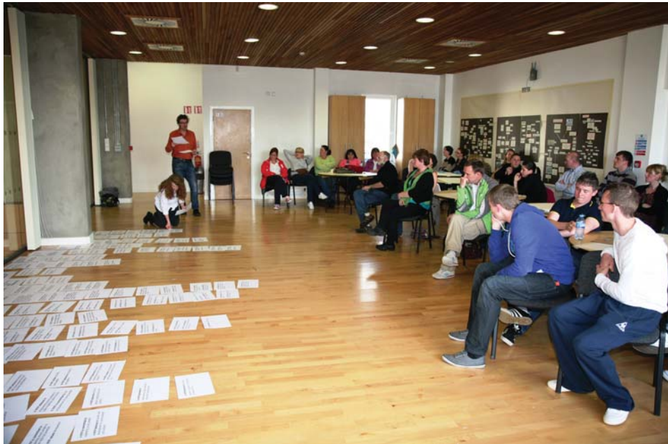
Arcade 1 Validation Event F2 Neighbourhood Centre, 2011.

Using a collaborative workshop process of content generation, revision, and descriptive refinement, Arcade Two evolved into an organisationally self-generated construction of their arts-based pedagogy.