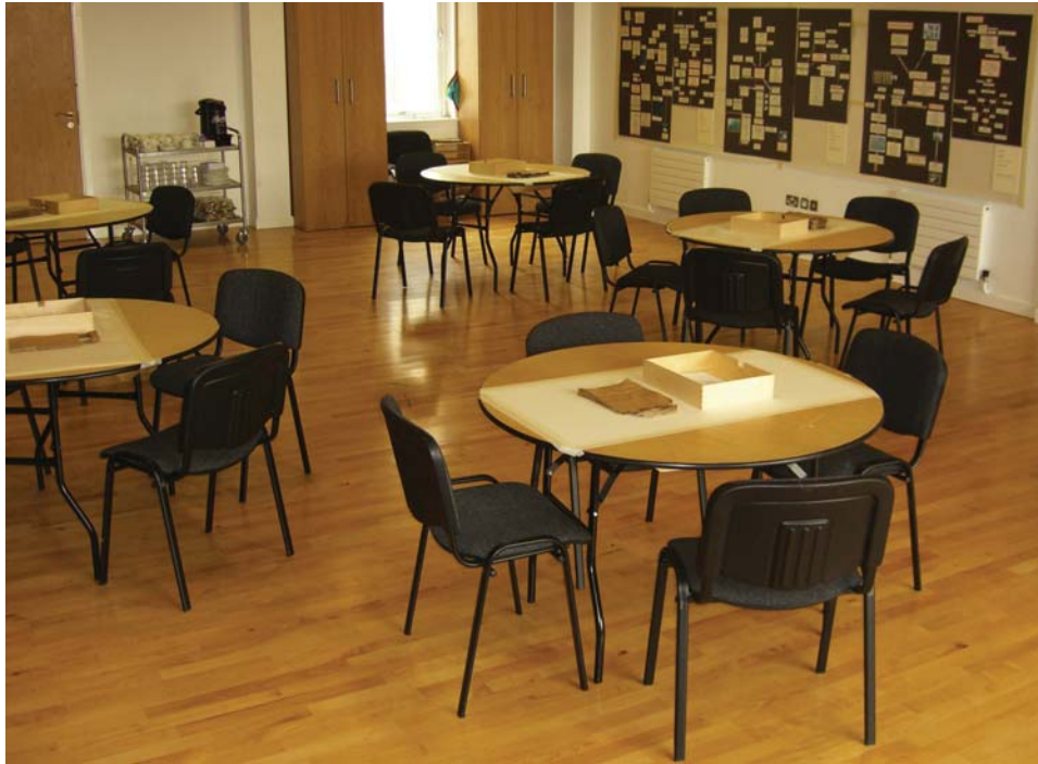
Arcade 1 Validation Event F2 Neighbourhood Centre, 2011.

Working with those 476 value statements, a Values Framework was constructed as a way of organising the emergent themes into a synthesis of Principles of Practice for the Rialto Youth Project. The generation of those Values culminated in a Validation Event at the F2 Neighbourhood Centre in Rialto. The Validation event borrowed the exhibition display function to decode and critique the content. The room was organised as part exhibition and part workshop space. The refined maps of organisational structures and territories were installed along the available wall and window space.