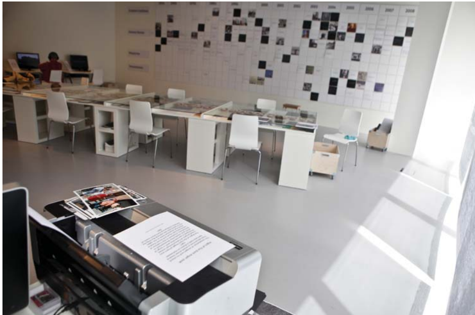
Cultural Archaeology 2009.

Studio 468 is a dedicated studio space housed in the St. Andrew's Community Resource Centre in Rialto 15 . The Studio 468 residency programme is structured to encourage artists to combine the experience of an autonomous studio residency with the experience of direct engagement with the Rialto community. 16 Vagabond Reviews and Fatima Groups United secured a six-month residency at the studio where the Cultural Archaeology process was initiated. Taking the form of community-based ethnography towards capturing the history of artistic and cultural practices in Fatima / Rialto from 1949 to 2010, Studio 468 became an open site of (re)collection, a space for inviting in, gathering, reviewing, and representing narrative seams on a community history with community and youth leaders, representative residents groups, artists, and community activists. As more storytellers passed through the studio, the recollections spanned through the decades but focused most intensively on more recent times when arts and cultural practice were brought into play by the community and its leadership in the struggle to secure meaningful agency within the urban regeneration process.