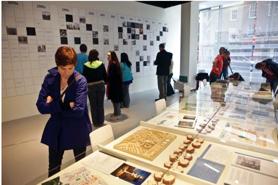
Fatima, A Cultural Archaeology , NCAD Gallery, 2009.

The opportunity to access the gallery space was an example of the creative tension between the notion of the gallery as a fixed sanctuary of stable content as opposed to content with a user interface. We faced this challenge most forcefully when working through the transition from Studio 468 to the NCAD gallery, where we felt the pressure to present finished work. Instead, we transposed the ethnographic process, which began at Studio 468, into the gallery space and reformulated the exhibition as a residency. The gallery was transformed into a participatory space for the production of local, embodied knowledge of a particular neighbourhood.