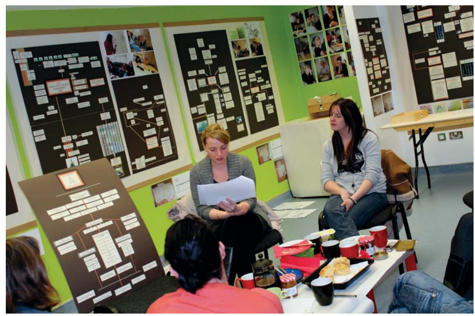
Arcade 2 Revision and Refinement, Rialto Youth Project room F2, 2013.