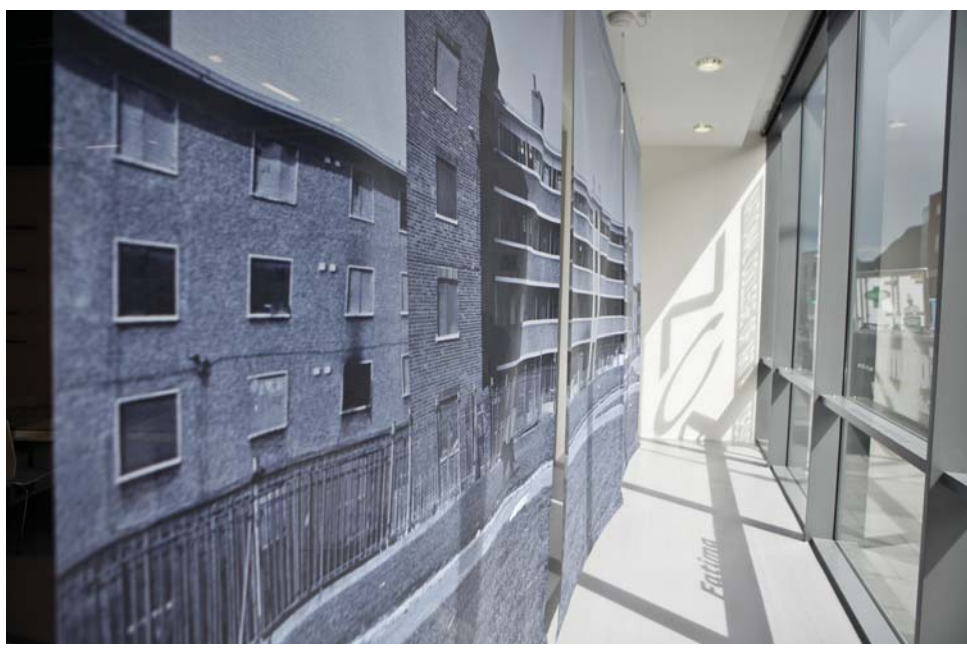
above: Fatima, A Cultural Archaeology, Timeline Wall NCAD Gallery, 2009.