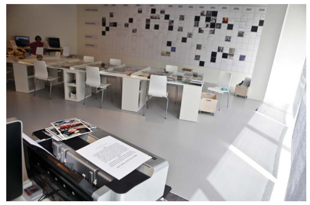
Cultural Archaeology 2009.

Studio 468 is a dedicated studio space housed in the St. Andrew's Community Resource Centre in Rialto <sup>15</sup>. The Studio 468 residency programme is structured to encourage artists to combine the experience of an autonomous studio residency with the experience of direct engagement with the Rialto community. <sup>16</sup> Vagabond Reviews and Fatima Groups United secured a six-month residency at the studio where the Cultural Archaeology process was initiated. Taking the form of community-based ethnography towards capturing the history of artistic and cultural practices in Fatima / Rialto from 1949 to 2010, Studio 468 became an open site of (re)collection, a space for inviting in, gathering, reviewing, and representing narrative seams on a community history with community and youth leaders, representative residents groups, artists, and community activists. As more storytellers passed through the studio, the recollections spanned through the decades but focused most intensively on more recent times when arts and cultural practice were brought into play by the community and its leadership in the struggle to secure meaningful agency within the urban regeneration process.