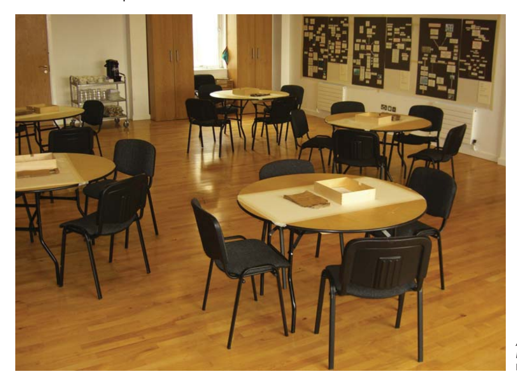
Arcade 1 Validation Event F2 Neighbourhood Centre, 2011.

Working with those 476 value statements, a Values Framework was constructed as a way of organising the emergent themes into a synthesis of Principles of Practice for the Rialto Youth Project. The generation of those Values culminated in a Validation Event at the F2 Neighbourhood Centre in Rialto. The Validation event borrowed the exhibition display function to decode and critique the content. The room was organised as part exhibition and part workshop space. The refined maps of organisational structures and territories were installed along the available wall and window space.