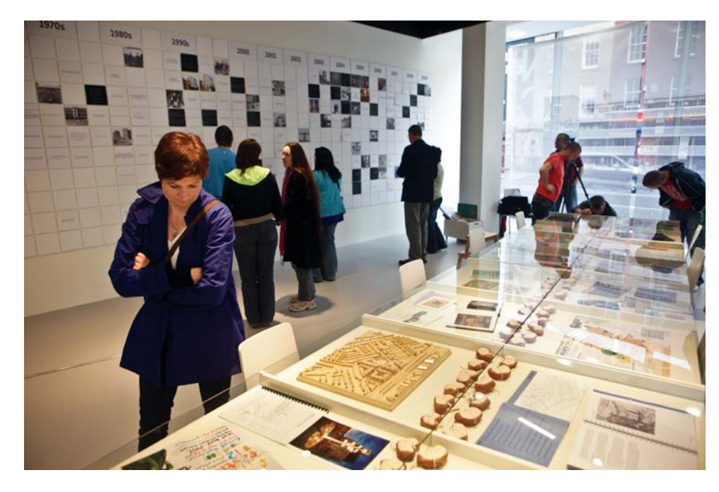
Fatima, A Cultural Archaeology, NCAD Gallery, 2009.

The opportunity to access the gallery space was an example of the creative tension between the notion of the gallery as a fixed sanctuary of stable content as opposed to content with a user interface. We faced this challenge most forcefully when working through the transition from Studio 468 to the NCAD gallery, where we felt the pressure to present finished work. Instead, we transposed the ethnographic process, which began at Studio 468, into the gallery space and reformulated the exhibition as a residency. The gallery was transformed into a participatory space for the production of local, embodied knowledge of a particular neighbourhood.