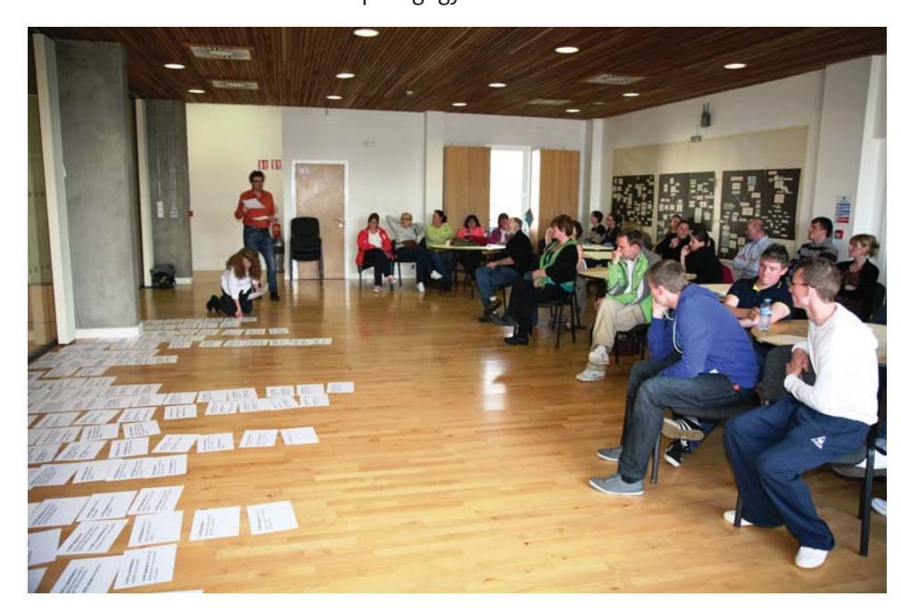
Arcade 1 Validation Event F2 Neighbourhood Centre, 2011.

Using a collaborative workshop process of content generation, revision, and descriptive refinement, Arcade Two evolved into an organisationally self-generated construction of their arts-based pedagogy.