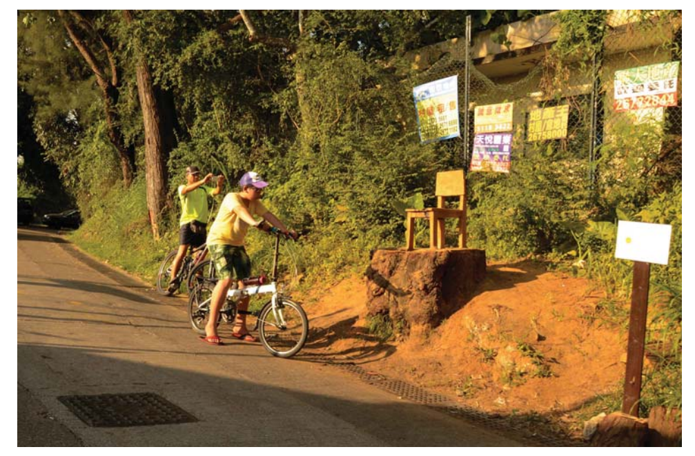
The Ping Che Village School Festival.