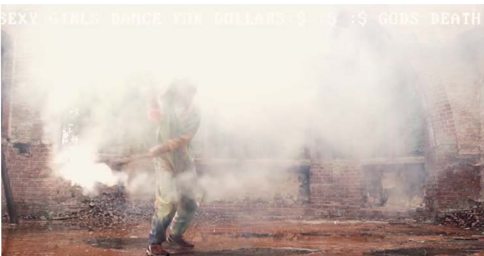
Video still, MEAT SPACE # MY GIRLFRIEND IS THE REVOLUTION PUNK IS DADA, PUNK IS DADA