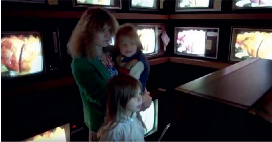
Video still, What the f**k is social reproduction? An introduction by Plan C , Plan C