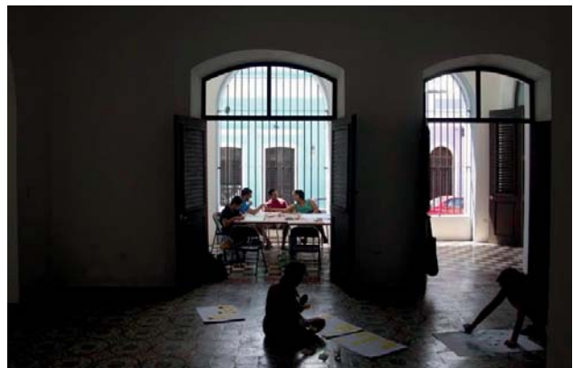
La Casa del Sargento, workshop space for La Práctica , 2014.