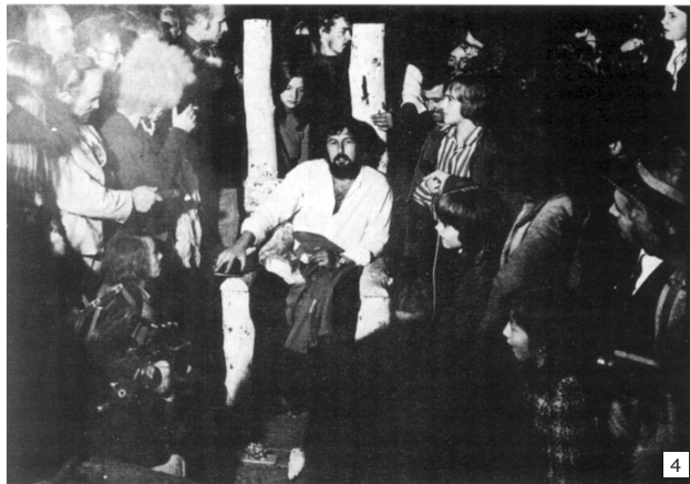
4 Baltasar Burkhard, Harald Szeemann, portrayed on 8th October 1972, the last day of Documenta 5, black-and-white photograph.

The Greek poet Homer is the central figure in Ingres's The Apotheosis of Homer (1827). Clearly apparent in the painting is the attribution of an ingenious spirit bestowed upon the poet by divine powers. Inscribed in this arrangement, moreover, are additional concepts and effects of gender difference, which since the Renaissance have constructed the male subject as the subject of central perspective. The female muses sit at the poet's feet. The specific dynamics of composition are such that the painting radiates beyond its edges and involves us in the events shown. The figures in the foreground turn towards us, appealingly, and direct our attention to the poet in a kind of substitutional testimony. As viewers, we close the circle around the poet, albeit on a much lower level. We complete the painting as it were, whose composition is obviously meant to address and include us.