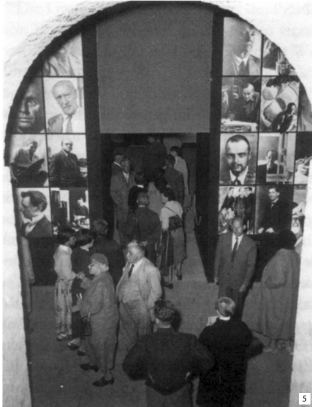
5 Documenta 1, 1955

It should be stated, that instead showing the persecuted or murdered artists it was a kind of evasive gesture to show the now called classic modernism as an internationally accepted style.