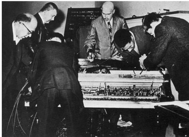
Emmett Williams, Wolf Vostell, Nam June Paik, Dick Higgins, Benjamin Patterson und George Maciunas in Phil Corners Piano Villes, Wiesbaden 1962

This letter, politely phrased and keen to assure Beuys that the piano will suffer no damage, undermines the image of the wild and revolutionary artist-as-subject. Prevailing social conditions, however, become apparent in the avant-garde artist's addressing Beuys as "professor." The publication conveys the hiatus between revolutionary impetus and polite, bourgeois manners, and makes plain the changing roles of artists, organisers, and collaborators.