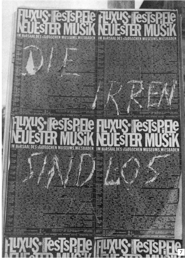
7 Poster, Wiesbaden Festival of New Music, Scribbles, 1962. Comments of German public: “the maniacs have broken loose”.

the art context. Not only reports of the participating artists (predominantly male), but also details of the “making of an exhibition” were included. Disclosing organisational processes implies institutional critique. The conventional notion of a closed, presentable, image-like performance is subverted. “Backstage” affairs are laid bare, thereby dismantling the aura of a work and of the idea of the authentic, spontaneous, and ingenious artist-as-subject.