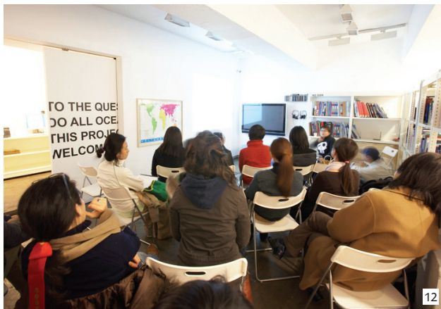
12 In Seoul the unusual but interesting worldmap was presented and Western hegemony questioned.