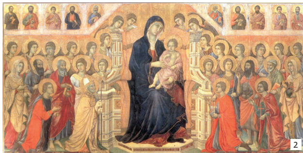
2 Duccio di Buoninsegna, Maestà, 1308–1311, tempera on poplar panel, 213 x 400 cm (Antependium= altar substructure)

The proportions of the figures clearly establish and substantiate an obvious hierarchy between divine creation and mortal humans. One figure stands at the centre of the picture. While the arrangement of figures and their proportions vest the central figure with power and authority, God is at the same time also human. The picture presents itself as a truth, hierarchically situating us as viewers standing in front of it and accepting instruction.