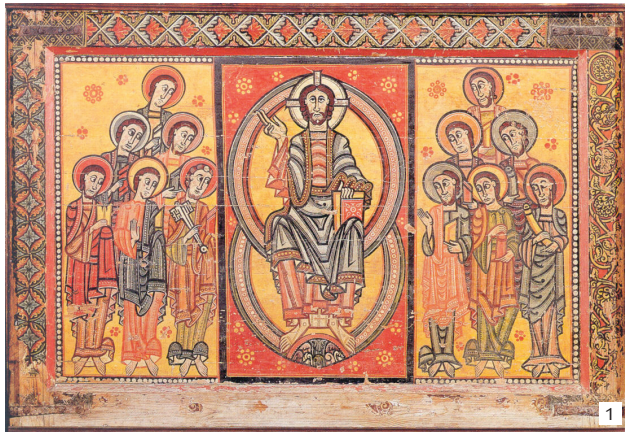
1 Spanish Antependium [alter substructure] with Christ in the Mandorla and with the Twelve Apostles, around 1120, Barcelona

power: a cast figure enthroned amid a group of persons is a highly traditional kind of image composition. In what follows, I will discuss three pictures selected from Dumont's Encyclopedia of Arts and Artists. Each of these depictions adheres to the basic pattern, since the restaging of this pose resonates with previous patterns of meaning. I will comment only briefly on the image composition of these works, ignoring other aspects 3 because I will especially looking into the appeal character of images in the political sphere.